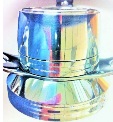
3) Horn button installed with riser.