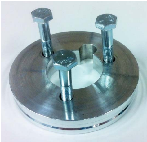
1) Spacer and hardware

Designed to raise all GT3 horn buttons \frac{1}{2} " to allow for additional shaft clearance (if necessary) or can be used to raise horn button if desired.