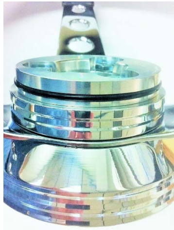
2) Riser is positioned between wheel and horn button base.